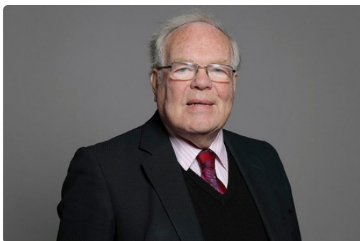
David Trevor Shutt, Baron Shutt of Greetland, OBE, PC 16 March 1942 – 30 October 2020