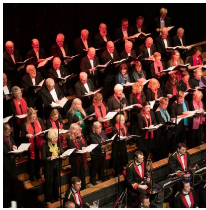
Carols and Brass at Victoria Theatre, Halifax