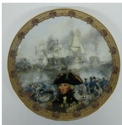
Davenort Plate commemorating the Battle of Trafalgar.