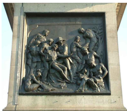
Plaque of The Battle of the Nile, at the base of Nelson's Column, London, cast in bronze from French cannon taken at the Battle of Waterloo.

Haydn originally entitled his work 'Mass for Troubled Times', reflecting both political and personal circumstances at the time. Having just won four major battles and crossed the Alps, threatening Vienna itself, Napoleon must have seemed an unstoppable force, but at the very time of the debut of the Missa in Angustiis , in 1798, news came of a stunning victory by the British Navy under the leadership of Nelson which destroyed most of Napoleon's fleet. Napoleon continued to have successes on land, and even bombarded Vienna in 1809 where the aging Haydn shouted 'Don't be afraid, children, where Haydn is, no harm can reach you!' However, The Battle of the Nile smashed Napoleon's control of the Mediterranean, and Nelson was hailed as 'the saviour of Europe'. Nelson visited the Esterházy court, where Haydn was Kapellmeister, in 1800 and may have attended a performance of the mass, thus cementing the now more familiar title of the Nelson Mass which was already in circulation.